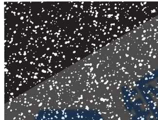
CPM High Speed Steel